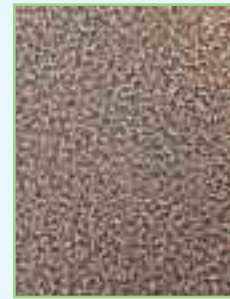
Antique Bronze Surface Detail