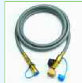
Natural gas hook-up/ installation kit included

This heater is designed for outdoor use only.