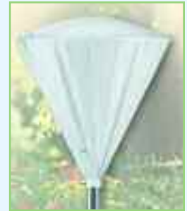
Optional Cover PCCVR